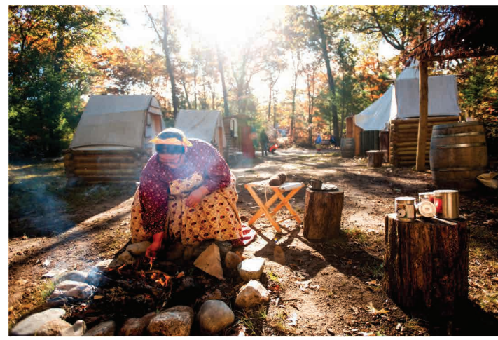
Michigan Heritage Center (above)