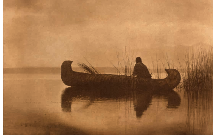
Kutenai Duck Hunter, Edward Curtis, c1910