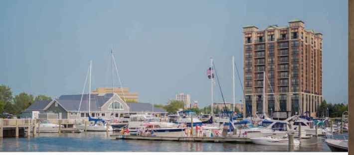
Lakehouse Waterfront Grille in Muskegon