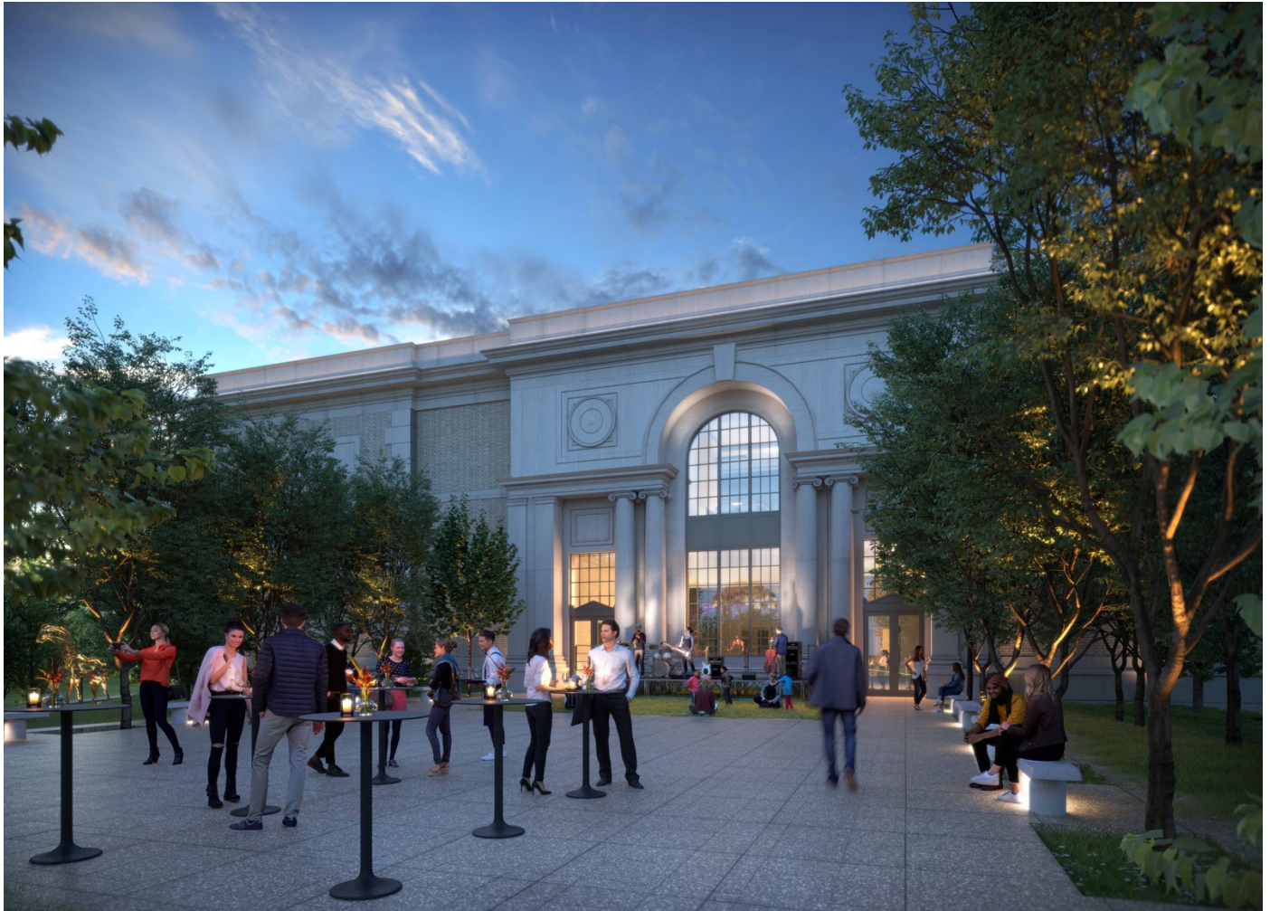
Artist’s rendering of front entrance plaza

The goal for the new Raclin Murphy Museum is taken from the leadership of the Snite Museum to provide “Experience with significant works of art intended to stimulate inquiry, dialogue and wonder for audiences across the academy, the community, and around the world—all in support of the University of Notre Dame’s Catholic mission.”