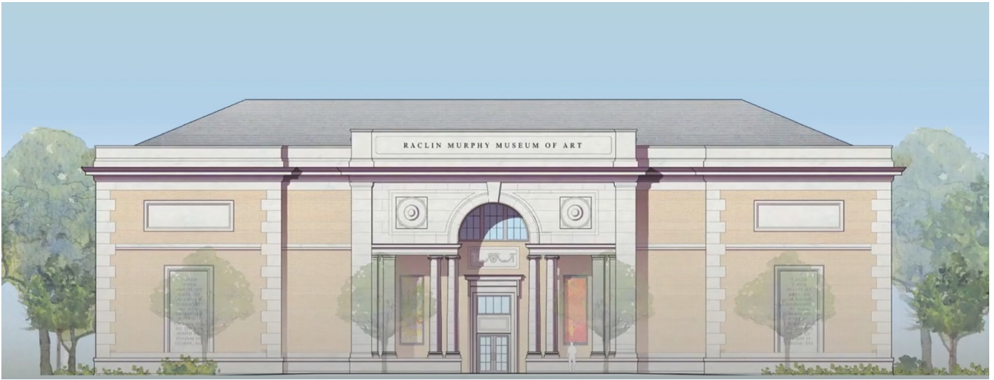
Artist's rendering of the west-facing Main Entrance

in all forms of visual arts are gifts we must share and experience with one another.”