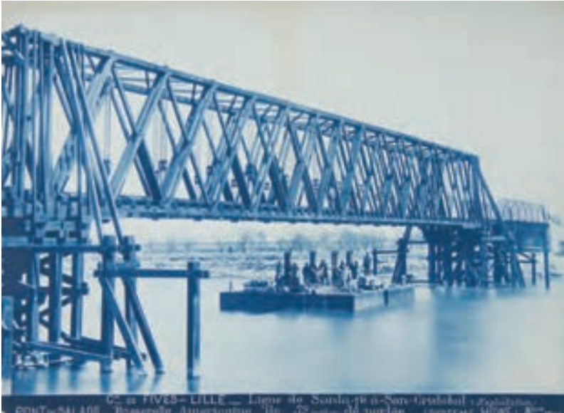
Construction Of The Railway Line Between Santa Fe And San Cristobald, 1890