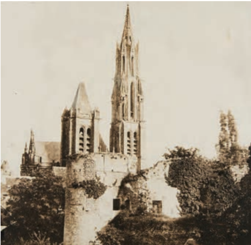
Senlis, Cathedral And Ruins Of Chateau, ca. 1852-55

Henri Le Secq and Charles Nègre both photographed at Chartres between 1851 and 1855, as restoration work was in progress. This print by an unidentified photographer adopts the same motif as Nègre's view of 1854, converted to photogravure in 1857. The taller trees, the vendors in the doorway, and the absence of construction debris suggest a later date.