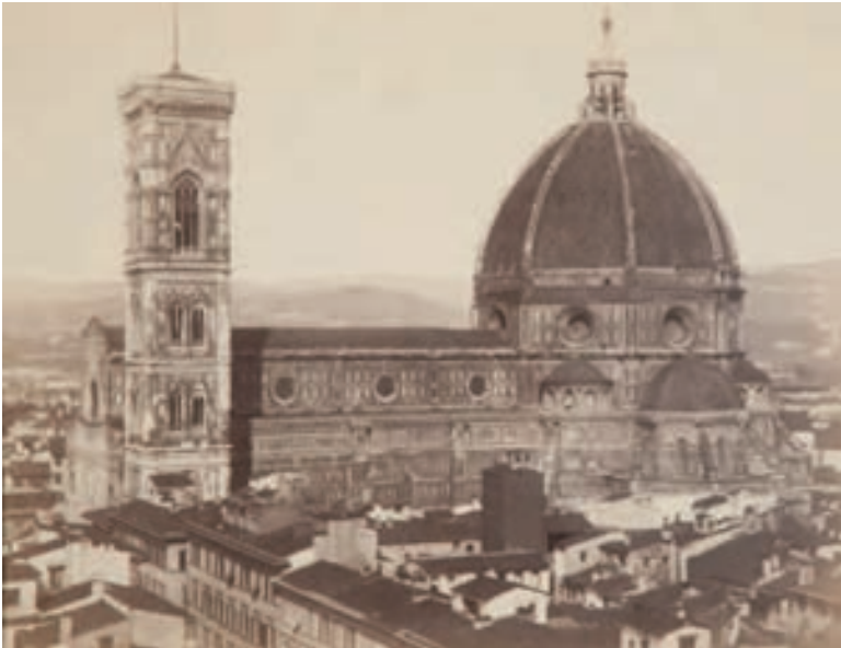
Florence, Cathedral Façade, ca. 1872

In the first view, taken before 1876, the characteristic profile of the cathedral with its dome almost hides the unfinished façade on the left. The current façade, begun in 1876, was inaugurated in 1887. It is shown here with the scaffolding still in place. These three photographs of “unfinished business” in Cologne and Florence underline the nineteenth century preoccupation with the past and its historical structures.