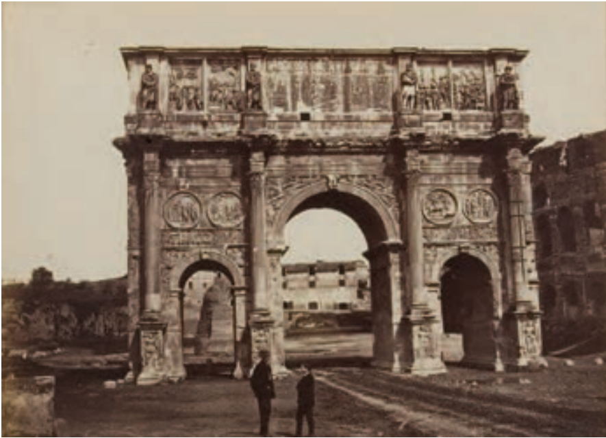
Rome, Arch Of Constantine, ca. 1865