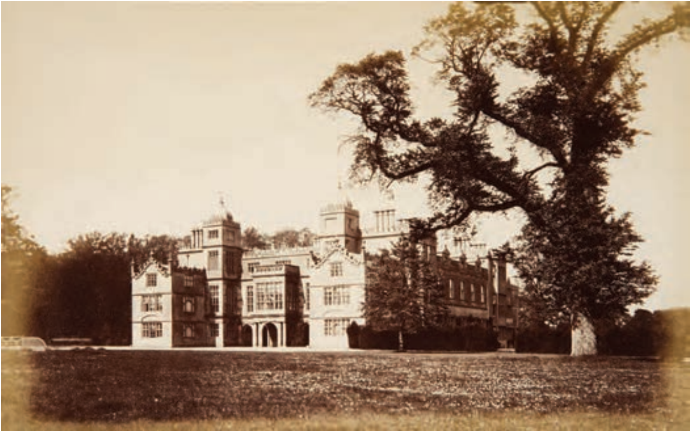
Album: English Manor Houses , undated Unidentified photographer, albumen silver prints The Janos Scholz Collection of Nineteenth-Century European Photography 1981.031.488.I (on view in long, flat, display case)

Photographic albums were commonly used to organize and present photographs. Frequently without captions, they raise questions of agency, intention, and legibility for us today. The country house photograph was a genre common in England, and this compilation includes the name of the estate, its owner and the county where it is located. When known, the date of construction and/or name of the architect are also included.