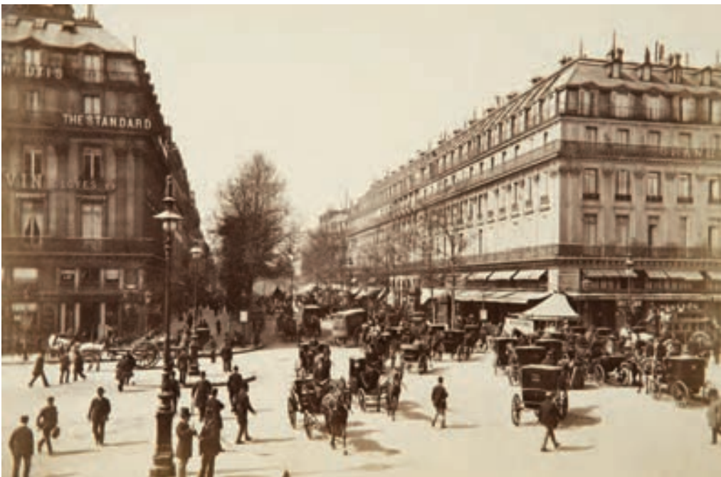
Paris, Boulevard Des Capucines, ca. 1870s-1889