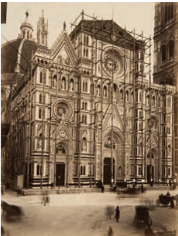
Florence, Cathedral With The New Façade, after 1875