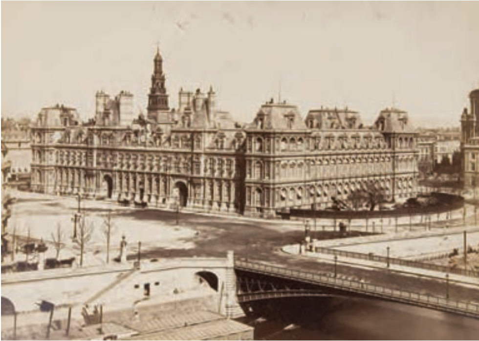
Paris, Hotel De Ville Destroyed By The Commune In 1871, before 1871 Unidentified photographer albumen silver print The Janos Scholz Collection of Nineteenth-Century European Photography 1984.048.008.H