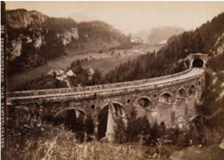
Album: Erinnerung An Die Semmeringbahn (Souvenir Of The Semmering Railway), ca. 1880

The Semmering railway was the first standard gauge rail line across the Alps. Designed and built by the engineer Carl von Ghega (1802–1860), the project for the line had been under consideration by the Austrian authorities since 1844. The impetus for the start of construction was the Revolution of 1848, as the line provided employment for a large number of potentially restless workers, away from the capital. Still in use today, the rail line has been classified as UNESCO World Heritage site. Oskar Kramer's photographs highlight the beauty of the natural setting rather than the intrusion of engineering into the Alpine landscape.