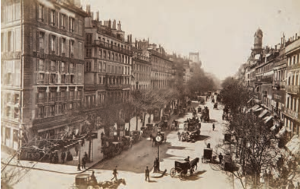
Paris, Boulevard Des Italiens, ca. 1870s-1889

These two views of the Boulevard des Italiens and its westward continuation, the Boulevard des Capucines, both located near the Paris Opera, illustrate the difference between the Parisian boulevards before and after Haussmann's reconfiguration. The street façades on Boulevard des Italiens are irregular, those of the Boulevard des Capucines exhibit the regular alignment characteristic of Second Empire Paris.