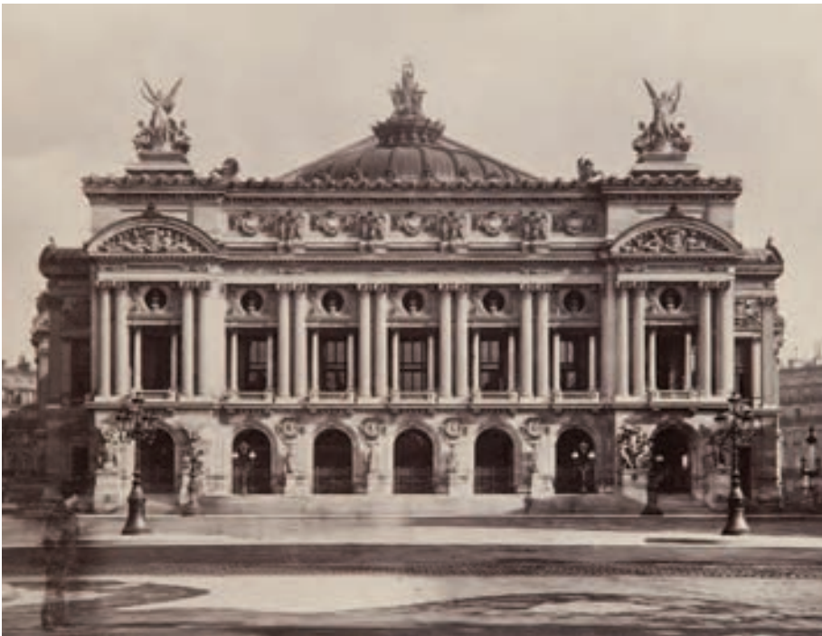
Paris Opera, Façade, after 1875

Combining metal framing and stone exterior facing, Charles Garnier's Paris Opera was the most explicit and extravagant statement of Second Empire architecture. Designed to accommodate the parallel spectacles of the stage and the audience, with imperial trappings, it was, ironically, not completed until after Napoleon III had been replaced by the Third Republic and had died in exile.