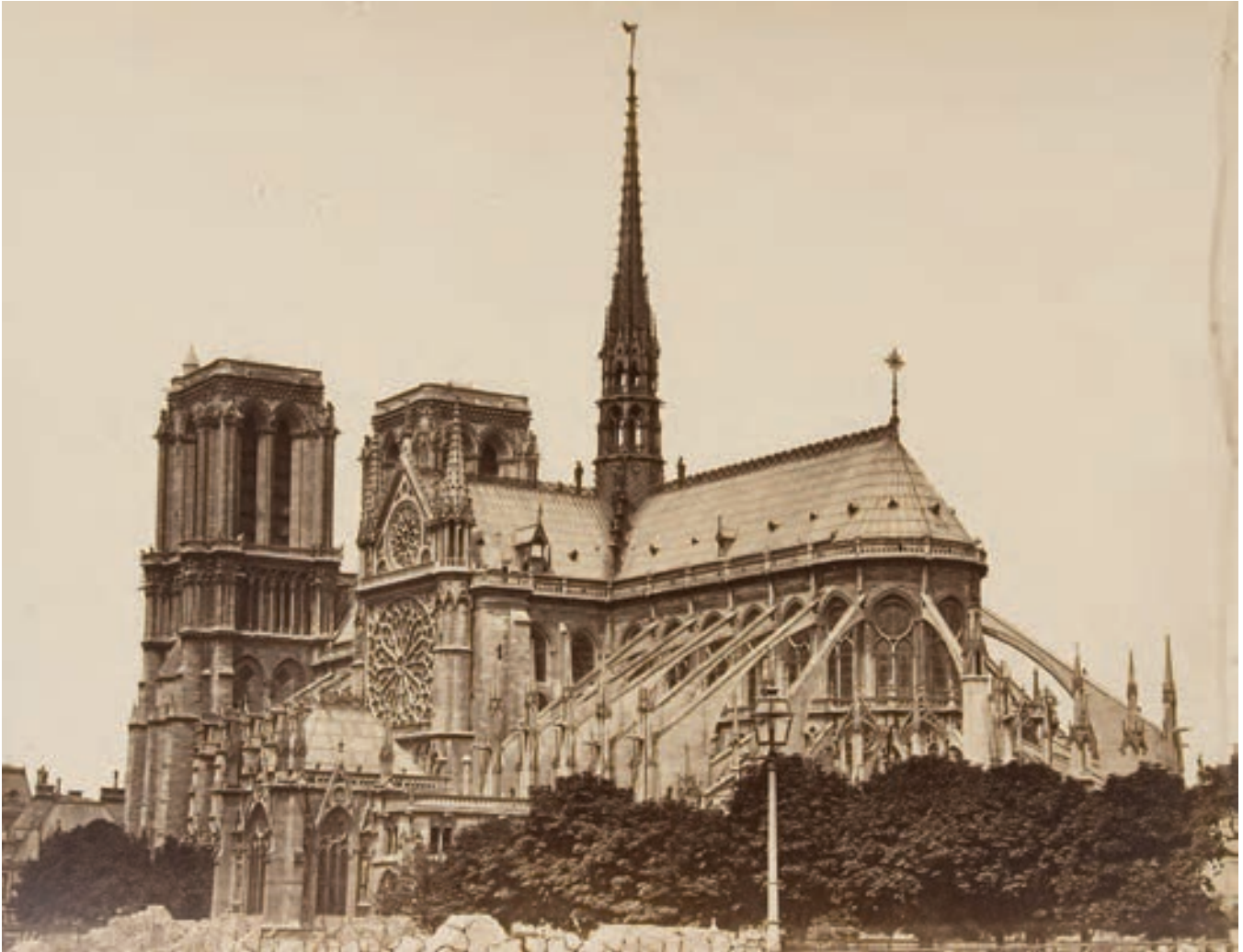
Paris, View Of Notre Dame From The South East, after 1860

Absent in the Baldus photograph, the spire over the crossing, removed in 1792 during the Revolutionary interventions on the cathedral, has been reconstructed after a design by Viollet-le-Duc by 1860. The appearance of the original spire had been preserved in engravings and drawings but Viollet-le-Duc developed his own design with a widened base, because he considered that the extant examples on other cathedrals such as Amiens were too thin.