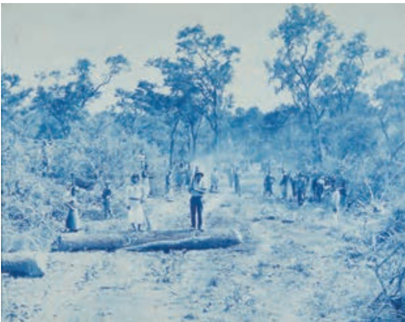
Construction Of The Railway Line Between Santa Fe And San Cristobald, 1890