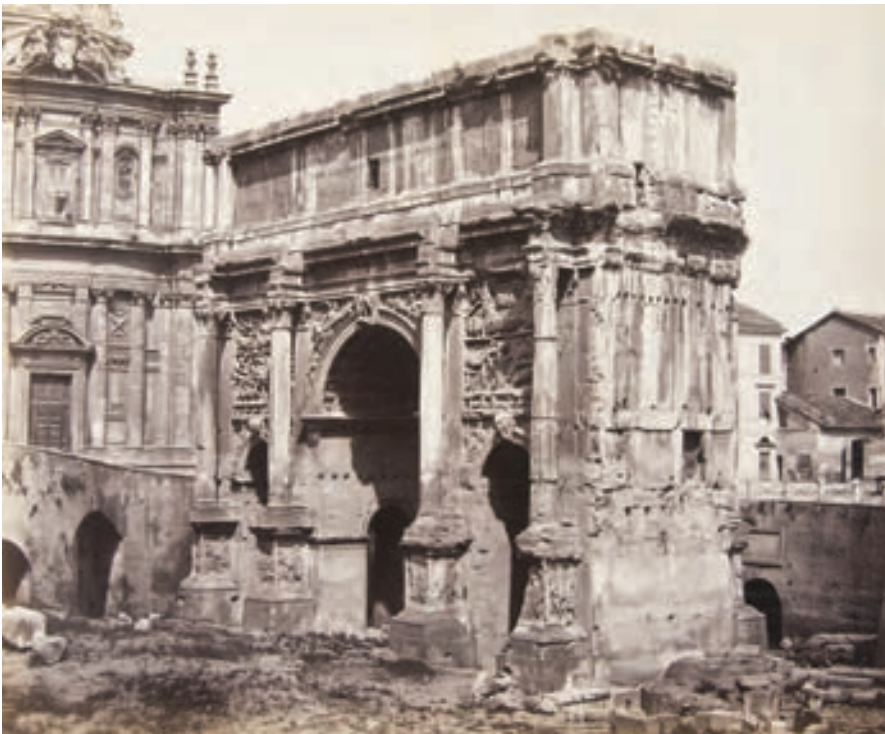
Rome, Arch Of Septimius Severus, ca. 1860

Photographs of Roman monuments continued a tradition of “vedute” or views such as the engravings of Piranesi, made for the Grand Tour visitors to Rome. As early as the 1850s, photographers adopted iconic views of Roman monuments made available to the increasing number of tourists brought by the steamships, railways and organized tours.