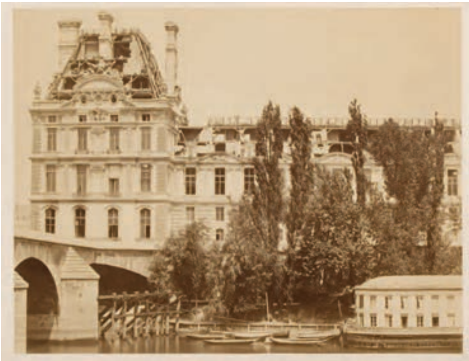
Paris, Louvre: Pavilion De Flore, after May 1871 albumen silver print The Janos Scholz Collection of Nineteenth-Century European Photography 1994.030.123