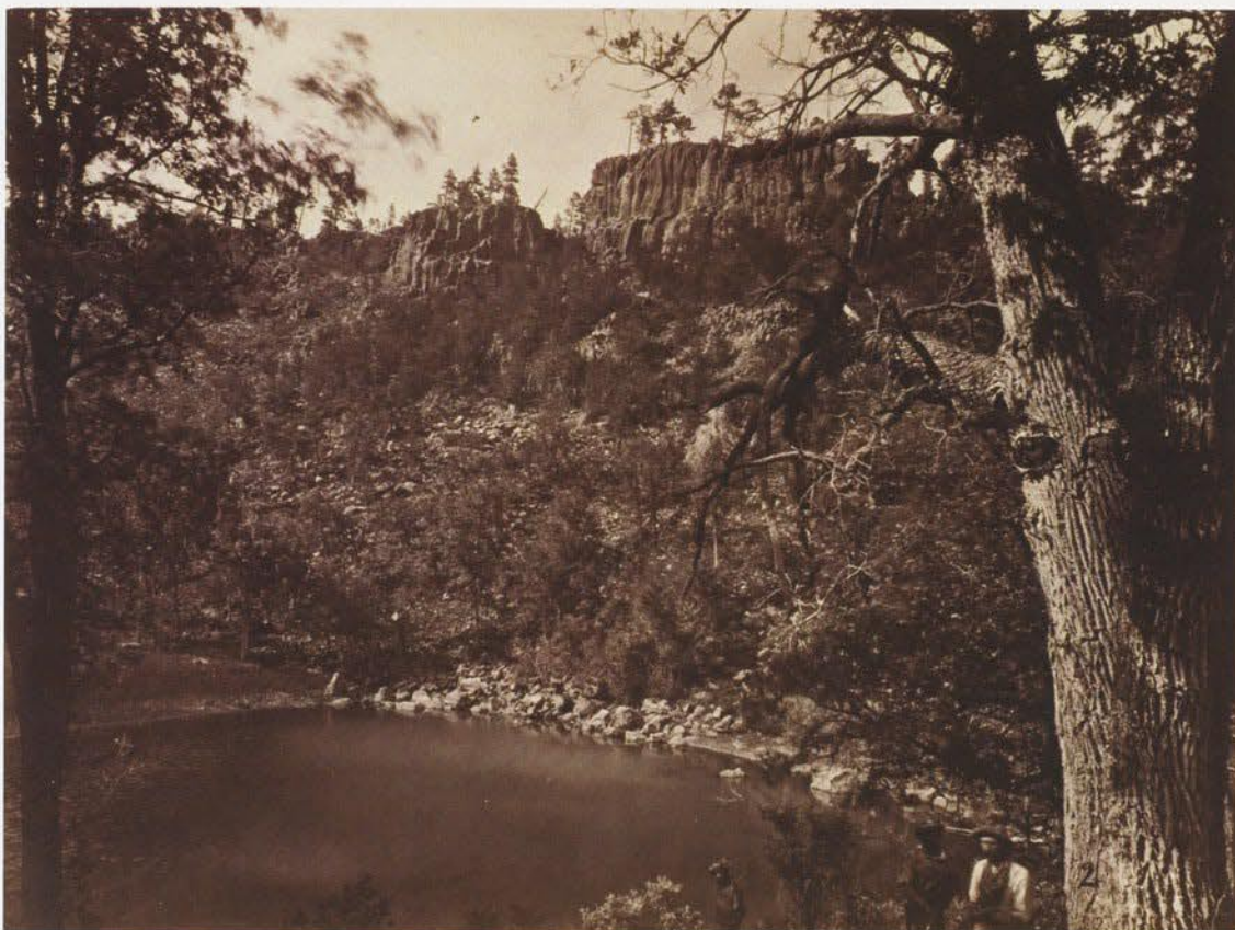
View on Apache Lake, Arizona, 1873

Timothy O'Sullivan (American, born in Ireland, 1840-1882)