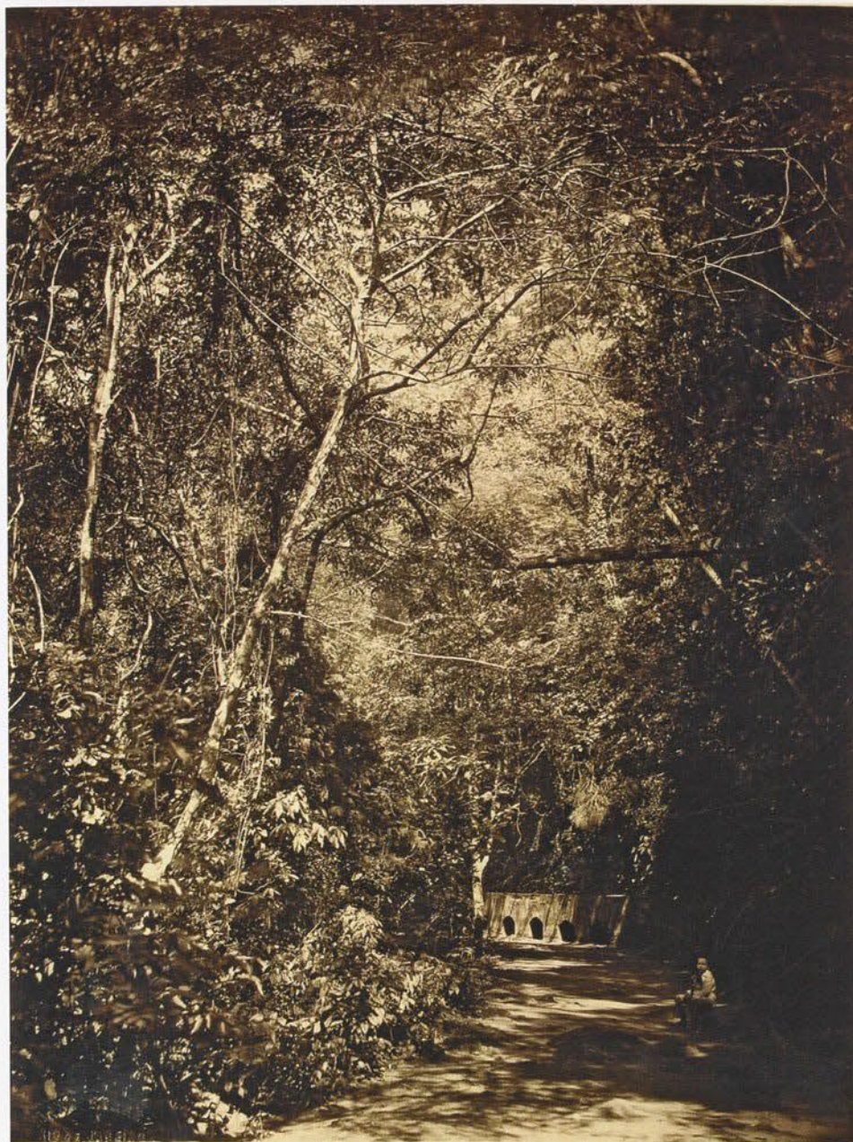
Corcovado - Chemin de l'aqueduc

Acquired with funds provided by the Mary Frances Mulholland Bequest 2005.039.007