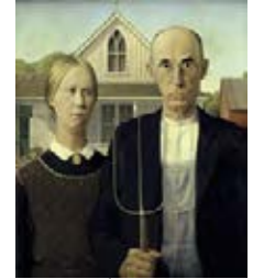
American Gothic , 1930 Grant Wood, American, 1891 – 1942