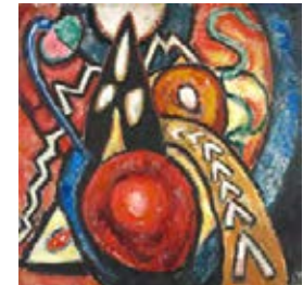
Movements , 1913 Marsden Hartley, American, 1877 – 1943

Its permanent collection holds nearly 300,000 works of art and encompasses over 5000 years. The Museum is most famous for its collections of Impressionist and Post-Impressionist paintings.