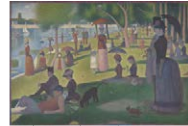
A Sunday on La Grande Jatte , 1884 Georges Seurat, French, 1859 – 1891

Founded in 1879, the Institute is one of the oldest and largest art museums in the United States.