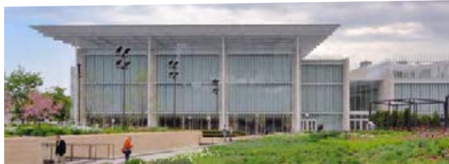
Art Institute of Chicago, Modern Wing