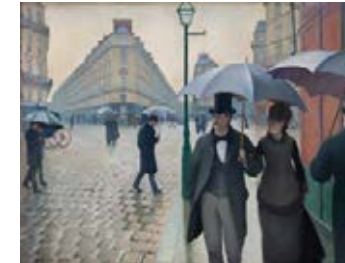
Paris Street; Rainy Day , 1877 Gustave Caillebotte, French, 1848 – 1894

thousands of artworks in the museum's collection—from their renowned icons to lesser-known works from every corner of the globe. Stewarded by 11 curatorial departments, it is encyclopedic, and includes works such as Georges Seurat's A Sunday on La Grande Jatte , Gustave Caillebotte's Paris Street; Rainy Day , Edward Hopper's Nighthawks , and Grant Wood's American Gothic .